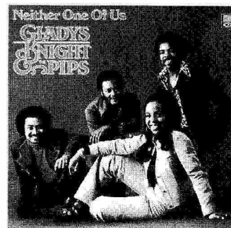
3. Gladys Knight & The Pips 393