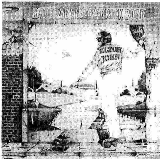
1. Elton John 426